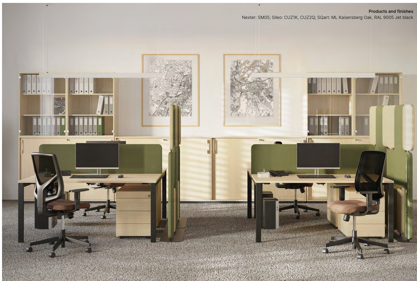
Products and finishes Nexter: SM05; Sileo: CUZ1K, CUZ2Q; SQart: ML Kaisersberg Oak, RAL 9005 Jet black